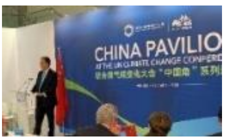
The Right Honorable Mark Field MP. UK Minister of State fro Asia and the Pacific at the Foreign & Commonwealth Office

"CCUS: Practices and Perspectives" Host: Ministry of Ecology and Environment, P.R. of China Co-host: Global CCS Institute